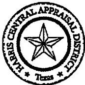
Secretary, Board of Directors Harris Central Appraisal District

WITNESS MY HAND AND THE OFFICIAL SEAL OF THE DISTRICT this the 22 nd day of July, 2024.