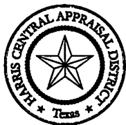
Assistant Secretary, Board of Directors Harris Central Appraisal District

WITNESS MY HAND AND THE OFFICIAL SEAL OF THE DISTRICT this the 17 th day of June 2026.