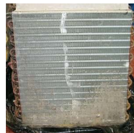
Figure 2. Coil fouling blocks airflow.

Microbial taxa identified by culturing methods in both office buildings and homes include Aspergillus versicolor , Cladosporium cladosporioides , Alternaria alternata , Penicillium spp. and